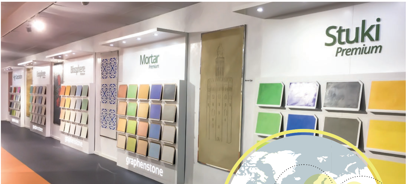
Graphenstone Spain Headquarters. Exposition & Showroom.

The rising demand of Graphenstone products made us settle three production plants in three different continents.