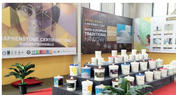
Principal hall of Graphenstone China Factory (Jinan).

Graphenstone is expanding and currently we have factories in Spain, Panama and China. The headquarters are placed at El Viso del Alcor (Spain). Moreover, in 2016 we invested 2,5 million Euros to upgrade our factory in order to quadruple the output of 2 million kilograms a month. Now we meet the rising demand in the whole Europe.